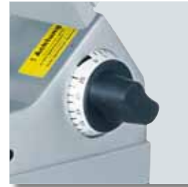
Slice thickness control knob for precise adjustment from 0 - 24 mm