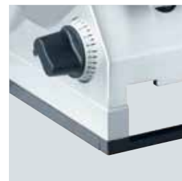
Closed rubber frame