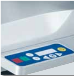
Control terminal with drip-proof foil keyboard