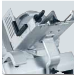
Can be switched to manual mode