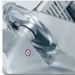
Freely accessible surfaces everywhere – even on the rear blade surface